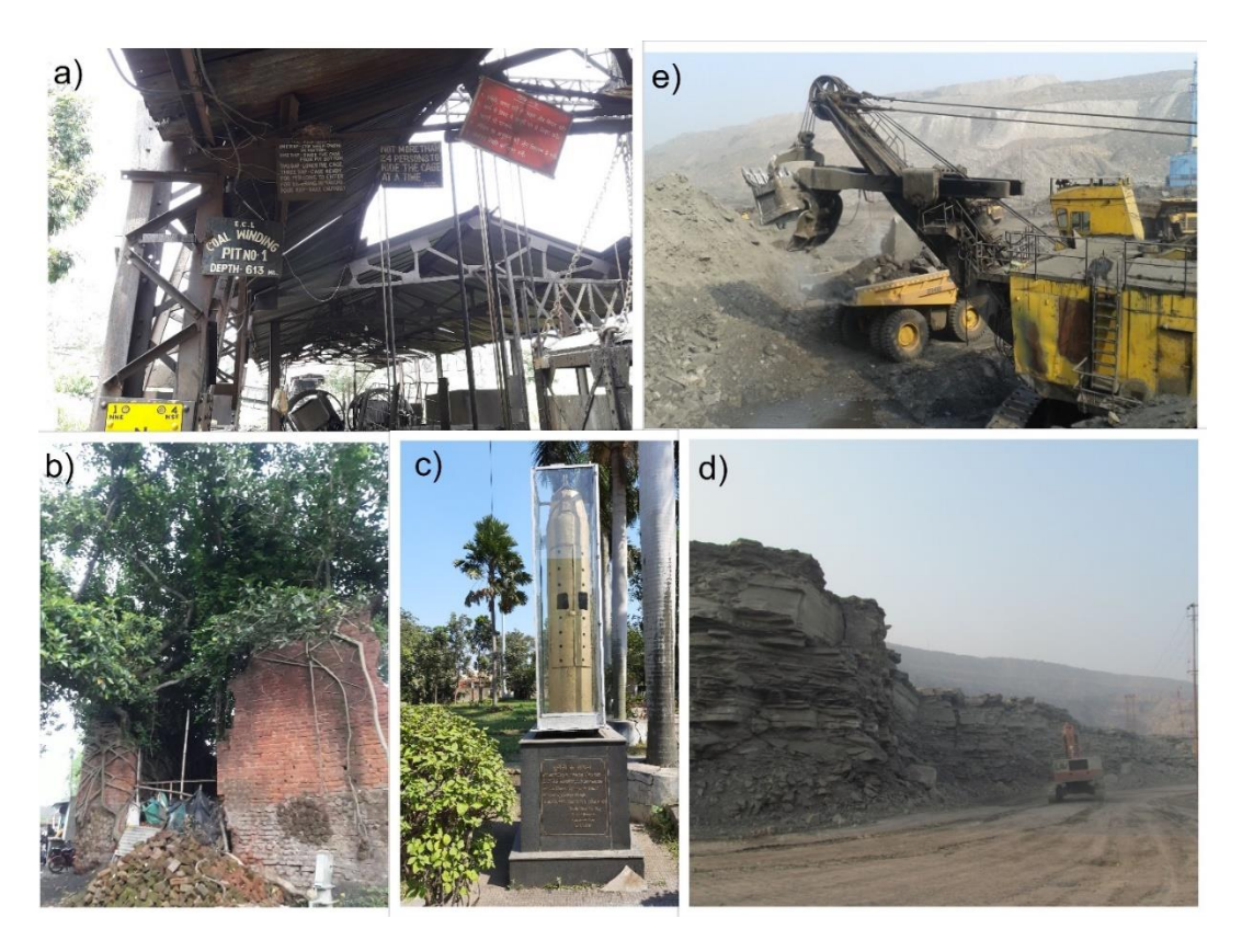
Figure 3: Photographs of the potential mining tourism sites, Raniganj Coalfield. (a) Mine cage and the signboard at Chinakuri pit. b) Old haulage room at Narankuri. c) Rescue capsule used in 1989 at Mahabir colliery. d) Excavated coal seam at Sonepur-Bazari OCP. e) Dragline-dumper combined operation at Khottadihi OCP.)