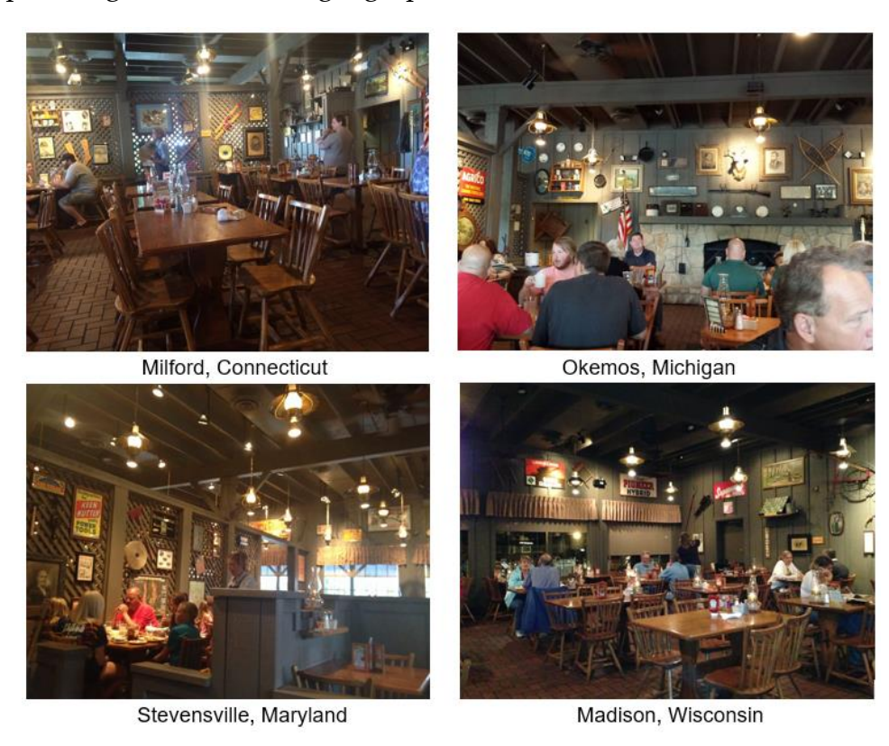
Figure 2. Similarities in Cracker Barrel's Interior Design<sup>3</sup>

When analyzing consumer images, it is clear that very little changes from one Cracker Barrel to the next (See Figure 2). Many of the stores and much of the design remains virtually unchanged, despite a few minor differences. Placelessness, as explained in the literature review, is the result of the "eradication of distinct landscapes" (Relph, 1976, Preface), the lack of connectedness to a place whether personally or physically (Harner & Kinder, 2011, p. 751), and results in everywhere looking like everywhere else (Harner & Kinder, 2011, p. 752). Cracker Barrels, while distinctly different than most of their surroundings, exist virtually unchanged place to place regardless of their geographic location.